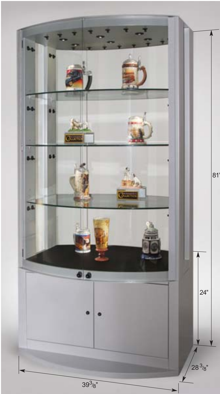
Showcase shown is a standard CM2 in White Silver Vein powder coated finish with swinging glass back doors.