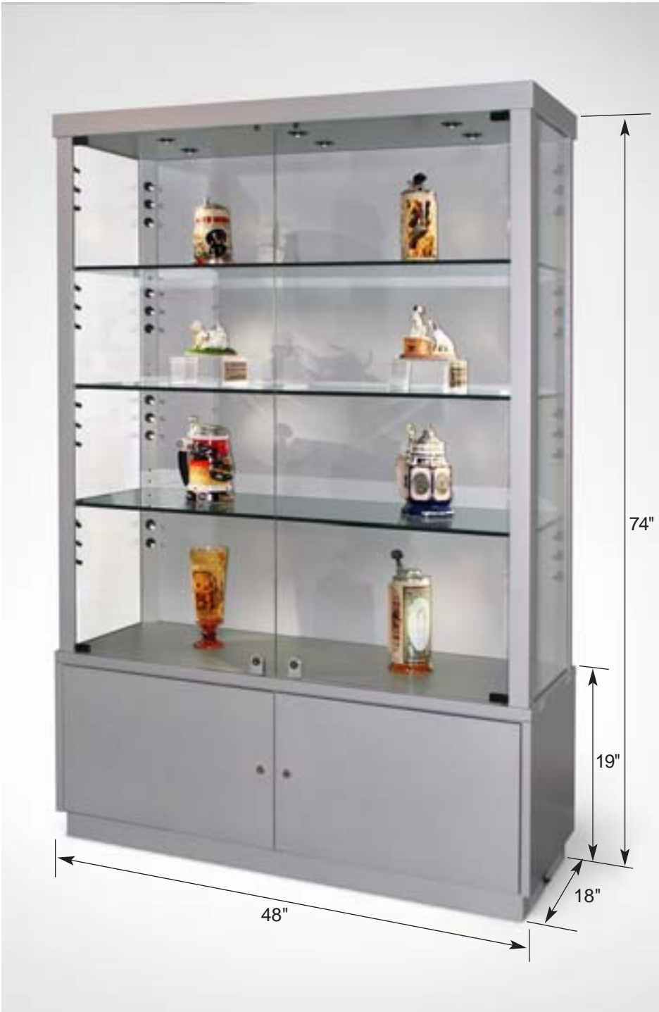
Showcase shown is a CM13 in White Silver Vein powder coated finish, shown with optional solid metal back.